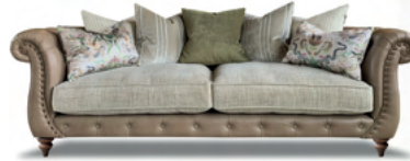
3 SEATER SOFA

SHOWN IN TOTE TAUPE LEATHER AND NOMAD BEIGE FABRIC