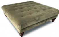
EMMA FOOT STOOL