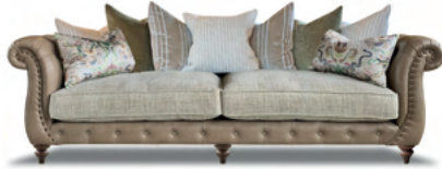
4 SEATER SOFA

All Scatter and Bolster Cushions are included