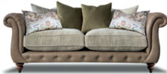
2 SEATER SOFA

SHOWN IN TOTE TAUPE LEATHER AND NOMAD BEIGE FABRIC