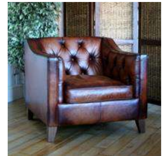
Displayed in Hand Antique Hide.