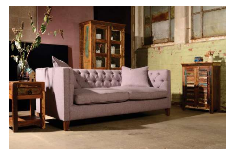
Displayed in Otley Wool Lavender.