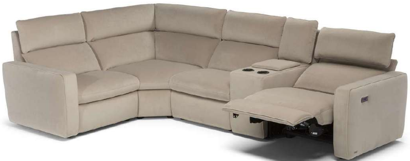
■ Vers. 272+011+291+323+F52