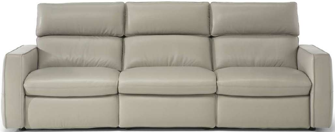
■ Vers. F50+291+F52