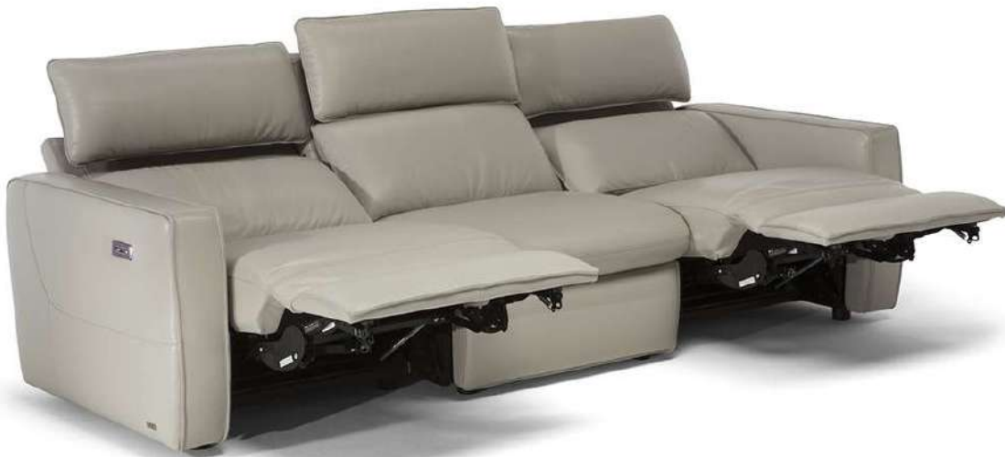
■ Vers. F50+291+F52